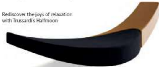
Rediscover the joys of relaxation with Trussardi's Halfmoon