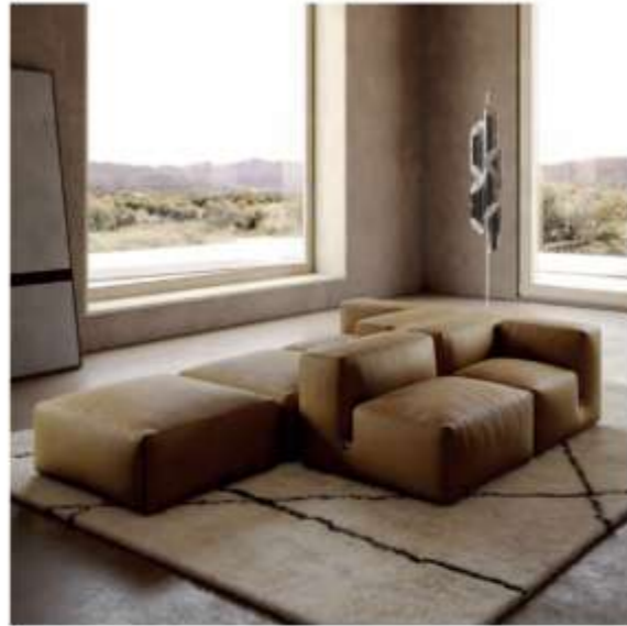
50 years after Mario Bellini debuted Le Mura with Cassina, he has developed a new edition with Tacchini