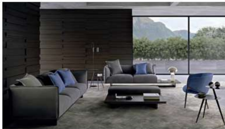
The upholstery of Segis' Rey is generous and soft with a deep seat. With its high armrests, Rey surrounds the user, but it can also be open on one side with a large wooden coffee table.