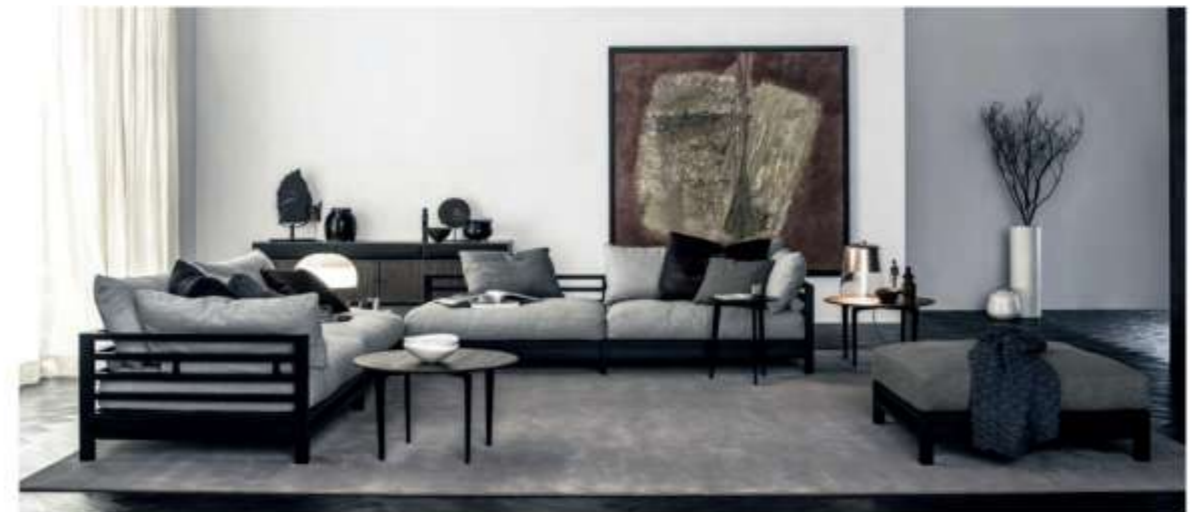
Ritzwell's Leewise takes inspiration from the company's Japanese heritage with its low seat surrounded by an ash frame