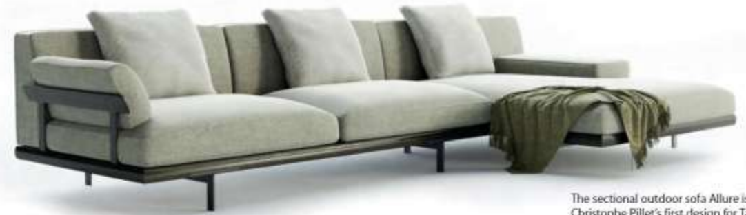
The sectional outdoor sofa Allure is Christophe Pillet's first design for Talenti