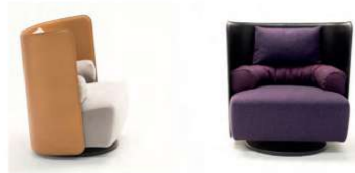
Zanotta has developed a new version of 1984's Campiello+