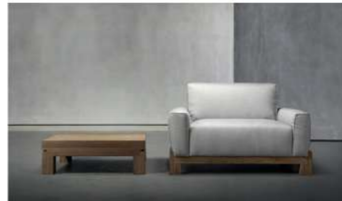
Bente is Studio Piet Boon's first upholstered outdoor collection, opting for rounded edges and softened details in contrast with its previous angular outdoor designs