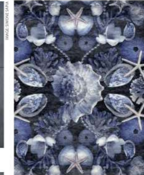
Sahrai's Allure rug is part of Kaleido of Life, the limited edition collection created by Marcel Wanders Studio