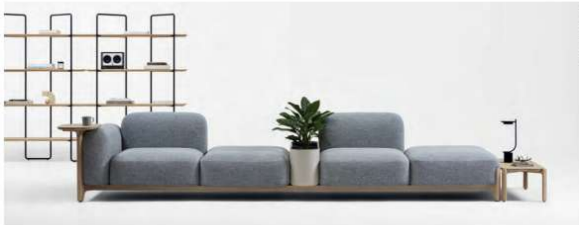
Prosteria's modular Sabot floats above its wooden frame