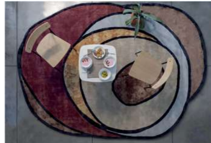
The five designs of Warli's Finisterre offer a series of concentric elements to represent the edge of the known world