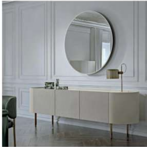
Turri's Roma sees it target a younger audience with dining and bedroom designs