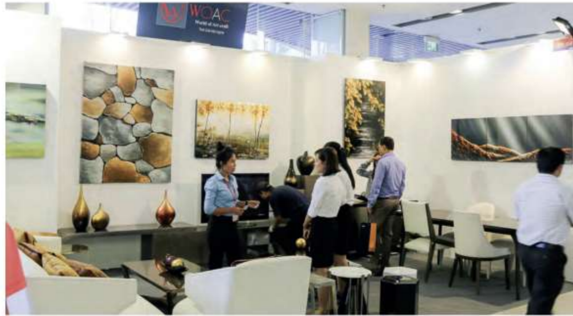
The show is returning for the first time since 2019