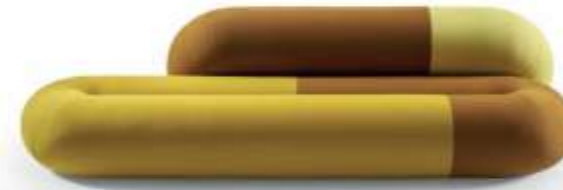
Take two upholstered cylinders and arrange them as you like for Sancal's Loop

In the second part of our Salone review, we reach Z. Visit: www.salonemilano.it