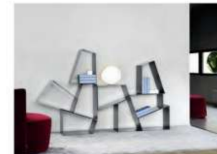
Take a metal module and magnets and create Verzelloni's SBA Dan in your own vision