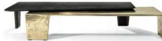
Concrete eroded by sea salt combines with metal for Visionnaire's Lego low tables