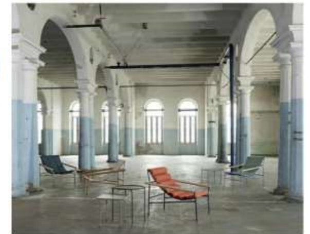
Dress_Code is a collection of coffee tables and chairs by gumdesign for S-CAB: gumdesign's first chair designs