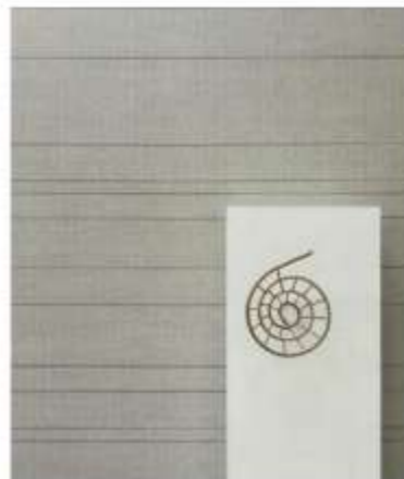
Willow was first seen at Helsinki Design Week 2002. Two decades on, Woodnotes has used willow bark to dye it and put it into production.